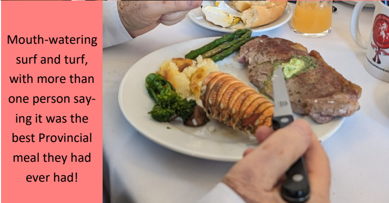
Mouth-watering surf and turf, with more than one person saying it was the best Provincial meal they had ever had!