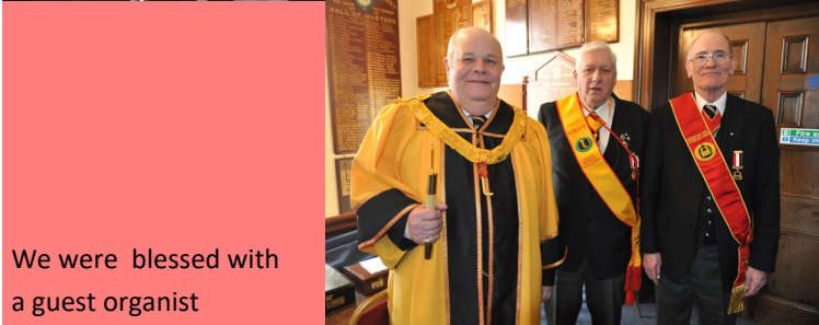
We were blessed with a guest organist