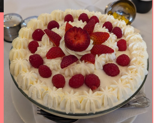
But the trifle stole the show, and many had more helpings than they would admit

GOT A STORY? WANT TO PROMOTE A MEETING? SND YOUR COPY TO WY BRO IAN SULLIVAN ( PROVAGREC@KENTOSM.ORG.UK )